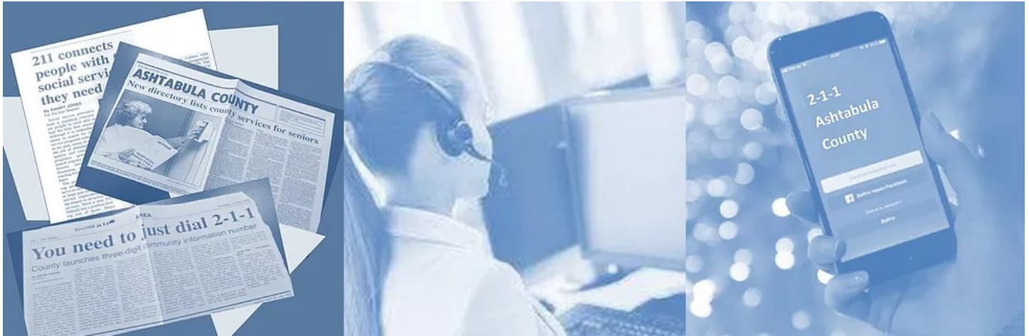
2-1-1 updates for the week of June 2nd, 2024