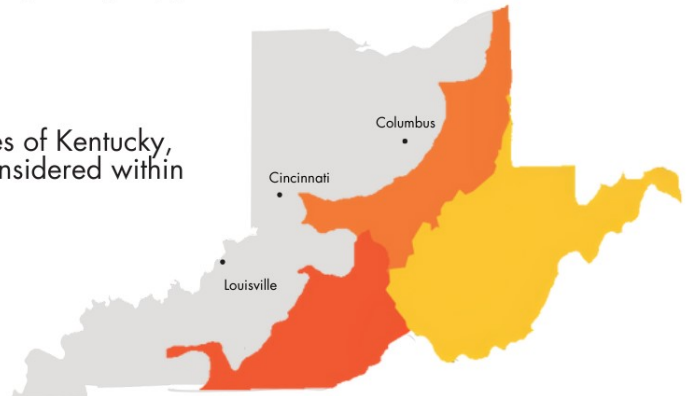
*Map above is for demonstration purposes only. Please refer to ARC's website for the full list of eligible counties in Kentucky and Ohio

APPLICATION LINK LIVE ON JANUARY 8th HERE: www.bridgeproject.org/apply